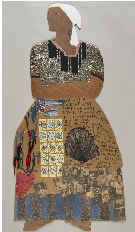
FIG. 3 We Will Be , by Lubaina Himid. 1983. (Walker Art Gallery, Liverpool)

has 'consistently staged [. . .] problems of loss, mourning, absence'. 14 Himid has always referred to her cut-outs as paintings, and the cut-out form may be viewed as a kind of animation, or activation, of figures less visible in European painting.