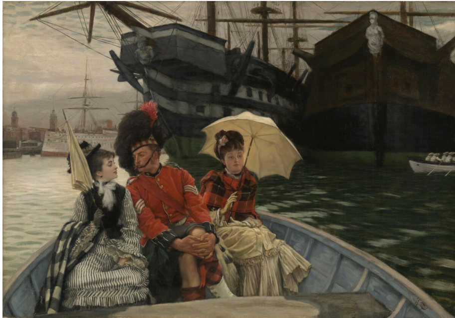
FIG. 5 Portsmouth dockyard previously known as How happy I could be with either , by James Joseph Jacques Tissot. 1877. Oil on canvas, 38.1 by 54.6 cm. (Tate).

Himid's series of eleven paintings titled Revenge (1991–92) engages closely with the genre of history painting, reconceiving the central role of Black women within official narratives of art and social history. One of the canvases in the series, Between the Two My Heart is Balanced FIG. 4 , is based on Portsmouth dockyard by the French London-based artist James Tissot (1836–1902) FIG. 5 . Tissot's painting depicts a Highland soldier seated between two women – possibly potential romantic interests, 15 or a woman and her sister as chaperone – in a boat sailing down the river Thames. Notably, the male figure is adorned in Highland Regiment uniform, with a redcoat (scarlet tunic), kilt and feathered bearskin, together indicating his military status, reflecting the romanticised and hypermasculine image of the Scottish soldier as fierce in combat. 16