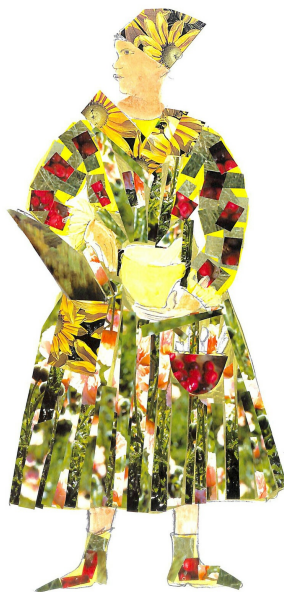
FIG. 21 'The Herbalist', by Lubaina Himid. 2004. Collage.

striking compositional similarities to Inigo Jones's costume designs, as seen in his design for a masquer from the Masque of Blackness , which was performed for King James I and Queen Anne of Denmark in 1605 FIG. 22. 61 Indeed, Jones's masque productions, with their incorporation of music, dance, extravagant costuming