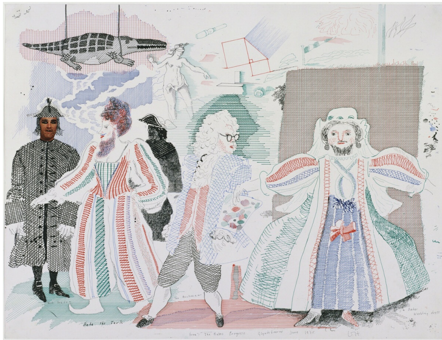
FIG. 7 Mise-en-scène for the opera The Rake's Progress the Rake's Progress , by David Hockney. 1975. Coloured inks, cut and pasted paper on paper, 50 by 65 cm. (Museum of Modern Art, New York).

Hockney's set designs FIG. 7 and costumes for Glyndebourne were also based on Hogarth's compositions. 21 Hockney's sets FIG. 8 featured extensive cross-hatching and a limited palette, reflective of the inks available in eighteenth-century England, to evoke the multi-layered graphic style of Hogarth's prints. 22 Hockney 'simply chose what would have been standard printing colours in the 18th century', for which he purchased 'good German inks; red, blue, green and black'. 23