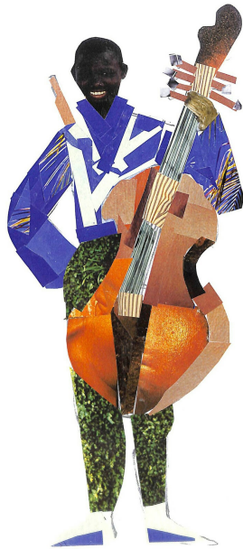
FIG. 20 'The Viola da Gamba Player', by Lubaina Himid. 2004. Collage. (Photograph the author; courtesy the artist).

Both installations engage with notions of the carnivalesque and of the decorative. Naming the Money , with its colourful, teeming crowd, speaks most closely to the carnivalesque, and it includes a striking series of expressive, commedia dell'arte -inspired Harlequin figures. Again, Himid's engagement with a European history of art (and theatrical performance) is critical to her postcolonial message. The collages that Himid produced for the installation FIG. 20 FIG. 21 bear