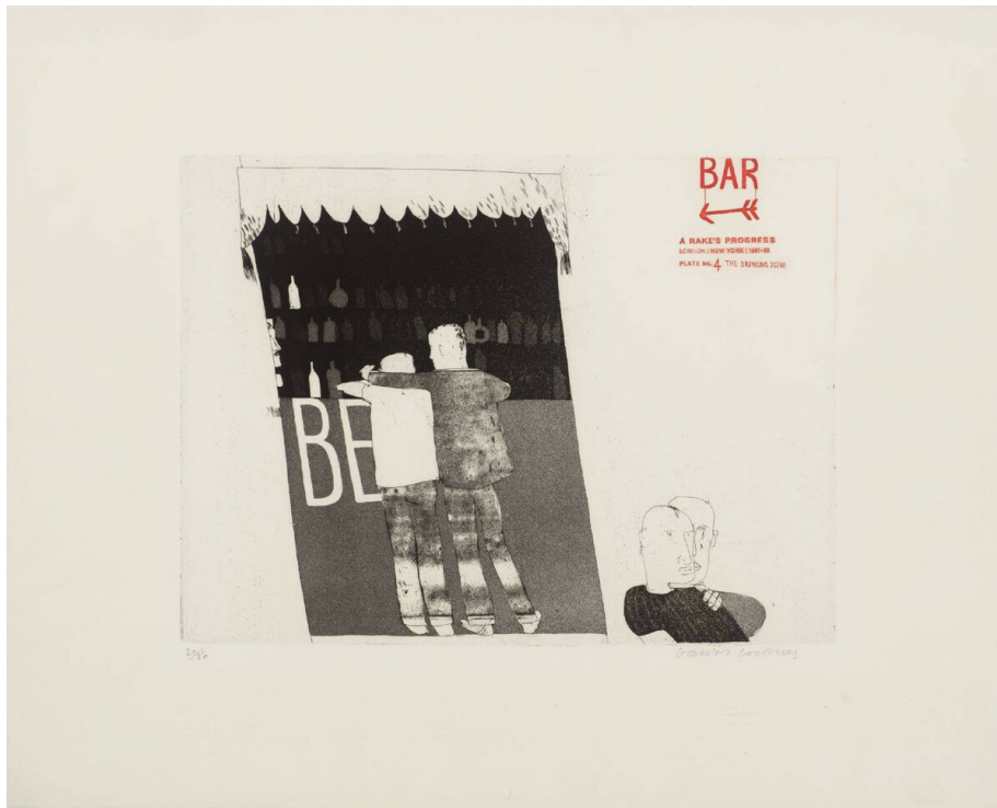
FIG. 6 'The drinking scene', from The Rake's Progress , by David Hockney. 1961–63. Etching and aquatint on paper, 29.5 by 40 cm. (Tate; © David Hockney).

Himid's work bears striking affinities with that of David Hockney in its use of broad sweeping brushstrokes, emphasis on the figure, commitment to art-historical research, explorations of LGBTQ sexuality, and its inclusion of graffiti-like text and other materials that speak to Pop-infused sensibilities. The two artists also share an interest in the theatre and theatrical, especially evident in their reimagining of series by Hogarth.