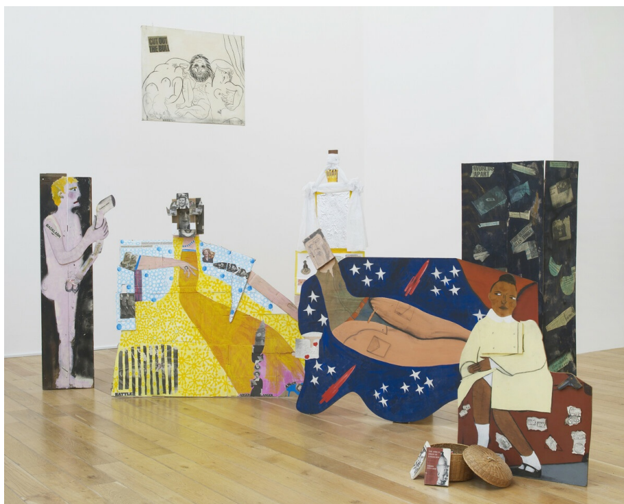
FIG. 12 Detail of Fig.1, showing the 'Real World' section of the installation. (Hollybush Gardens, London).

historical figures, yet only one of these was for a woman of African descent, Sojourner Truth. At the right, a towering Black woman artist in a dress embellished with wooden fish and a painted expanse of bluish water replaces Hogarth's standing Black male servant. Alluding to the Middle Passage, Himid turns Hogarth's critique of over-consumption and greed into a broader moral commentary on the British slave trade.