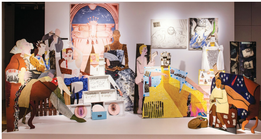
FIG. 1 A Fashionable Marriage , by Lubaina Himid. 1987. Acrylic on wood cut-outs with mixed media, dimensions variable. As exhibited as part of Turner Prize 2017 at Ferens Art Gallery, Hull (Courtesy Hollybush Gardens, London) (Hollybush Gardens, London).

In the early 1970s, when she was working at the now-defunct New Artists Gallery in London, Lubaina Himid met David Hockney. 1 This prompted Himid to begin an extensive study of Hockney’s Rake’s Progress print series (1960–61), at a time when Hockney was revisiting them while completing set designs for Igor Stravinsky’s opera The Rake’s Progress , to be presented at Glyndebourne, East Sussex in 1975. Quoting from William Hogarth’s eighteenth-century narrative series of the same name, Hockney’s series felt ‘very current’, to Himid, as it brought Hogarth back into the ‘thought-about, talked-about canon’. 2 Some fifteen years later Himid completed her own Hogarthian appropriation. A Fashionable Marriage FIG. 1, titled after Hogarth’s Marriage A-la-Mode (c.1733–35; National Gallery, London), 3 was an installation produced during what has been referred to as a ‘Black Arts Movement in Britain’. 4 In line with the politics of this loosely, and sometimes controversially, defined movement, 5 Himid’s Marriage critiqued conservative politics in the United States and United Kingdom in the 1980s as well as the exclusionary practices of the London art world.