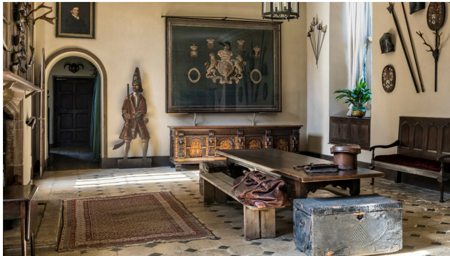
FIG. 17 A dummy board in the Great Hall at Canons Ashby, Northamptonshire.

In their form, Himid's cut-outs are marked by a layered textural complexity, often incorporating an expressive drawing style, collaged elements and scribbled, graffiti-like text. They appear hastily executed with rough edges, errant nails and jagged cuts of wood, in keeping with their conception as a form of theatrical prop, meant to be seen from a distance. Himid has remarked that 'Because of the theatre design, I made them to be temporary. They were not built to last. Built just for a show [. . .] it's about impact and experience and then it's gone'. 53 For this reason, there is a rough and slightly unfinished quality to some of the works, and the evidence of their making is apparent.