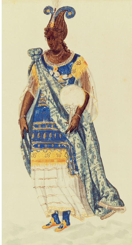
FIG. 22 Masquer: a Daughter of Niger , by Inigo Jones. c.1608. Watercolour on paper (The Devonshire collection, Chatsworth).

and sometimes special effects, has been a central influence for