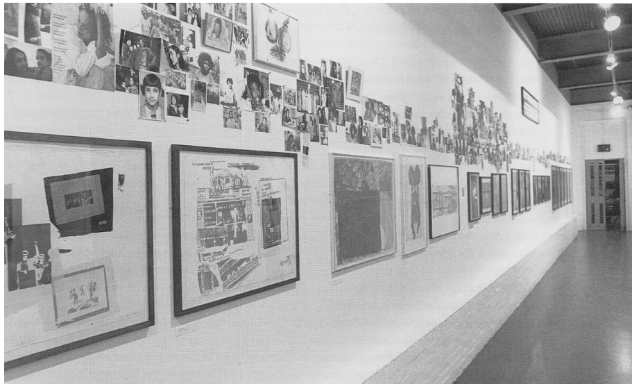
FIG. 2 Installation view of The Thin Black Line , at the Institute of Contemporary Arts, London. 1985.

During this period Himid gained increasing attention for both her own work and for organising feminist-driven exhibitions, publications and other curatorial and administrative efforts that ensured the visibility of Black women artists. 10 Three notable such exhibitions, all in London, were Five Black Women at The Africa Centre (1983); Black Woman Time Now , an arts festival held at the Battersea Arts Centre (1983–84); and The Thin Black Line , an exhibition at the Institute of Contemporary Arts (ICA; 1985) FIG. 2 . 11