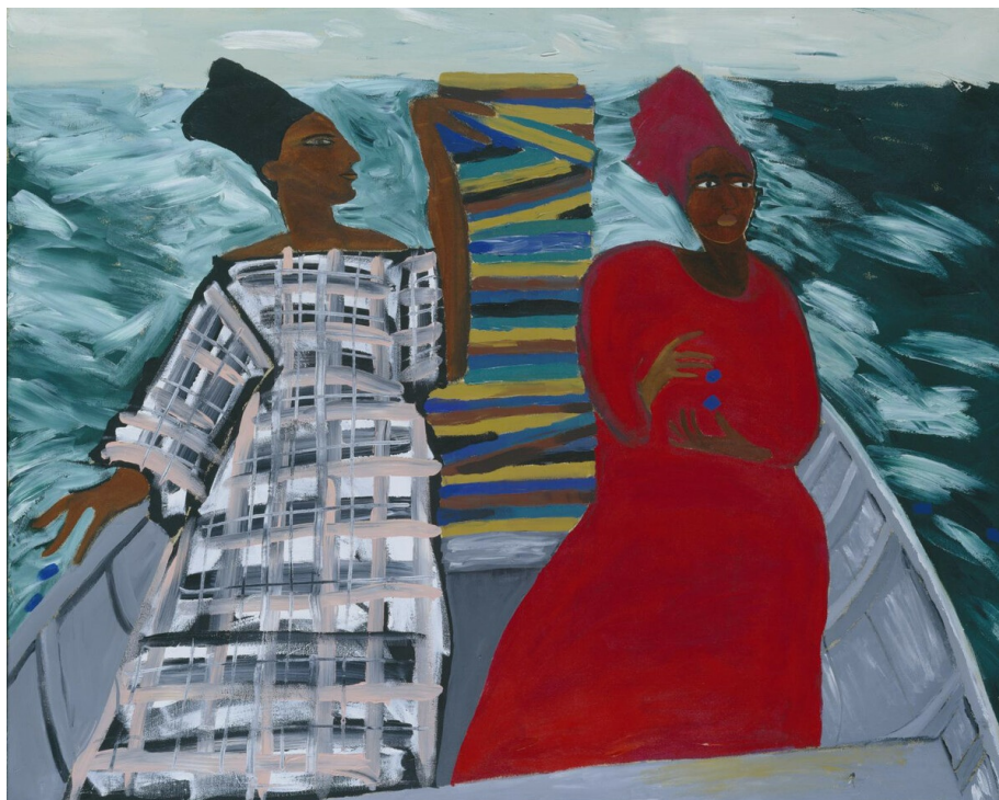
FIG. 4 Between the Two My Heart is Balanced , by Lubaina Himid. 1991. Acrylic paint on canvas, 121.8 by 152.4 cm. (Tate).

has 'consistently staged [. . .] problems of loss, mourning, absence'. 14 Himid has always referred to her cut-outs as paintings, and the cut-out form may be viewed as a kind of animation, or activation, of figures less visible in European painting.