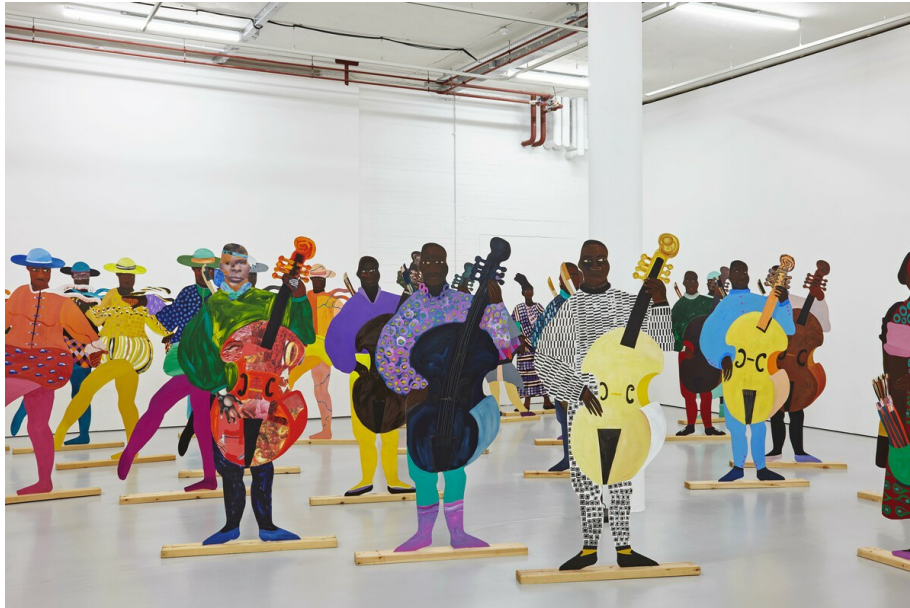
FIG. 19 Naming the money , by Lubaina Himid, 2004. Installation view of 'Navigation Charts' exhibition at Spike Island, Bristol. 2017. (Image courtesy Spike Island, Bristol, and photograph Stuart Whipps; work courtesy the artist and Hollybush Gardens, London).

Himid's engagement with cut-out figures and theatrical performance was significantly developed in the installation Naming the Money FIG. 19, which was first presented at the Hatton Gallery, Newcastle, in 2004, and more recently at Spike Island, Bristol, in 2017. 55 The installation includes one hundred life-size cut-out figures, framed collages on paper and a soundtrack featuring music and spoken narrative. It represented Himid's return to the cut-out form after a ten-year hiatus. 56