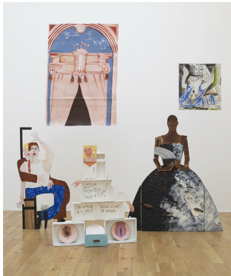
FIG. 11 Detail of Fig.1, showing the 'Feminist Artist' and the 'Black Artist'. (Hollybush Gardens, London).

historical figures, yet only one of these was for a woman of African descent, Sojourner Truth. At the right, a towering Black woman artist in a dress embellished with wooden fish and a painted expanse of bluish water replaces Hogarth's standing Black male servant. Alluding to the Middle Passage, Himid turns Hogarth's critique of over-consumption and greed into a broader moral commentary on the British slave trade.