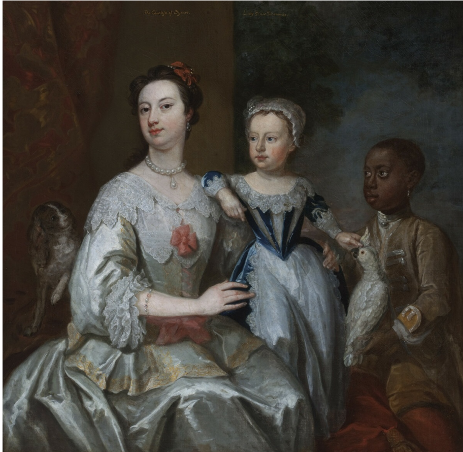
FIG. 13 Portrait of Lady Grace Carteret, Countess of Dysart, with a child, a Black servant, a spaniel and a cockatoo , by John Giles Eccardt. c.1740. Oil on canvas, 132 by 130 cm. (Ham House, Surrey).

'form of social currency [. . .] objects consumed and displayed in a semiotic system of status'. 42 This is also exemplified in John Eccard's portrait of Lady Grace Carteret, Countess of Dysart with a Child (possibly Lady Frances Tollemache), a Black Servant, Cockatoo and Spaniel (c.1740, FIG. 13) in which the servant child functions as a marker of wealth and status, and is also aligned with the exoticism of the pet cockatoo.