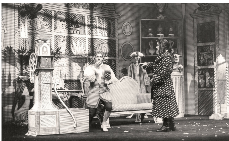
FIG. 8 The Rake's Progress by Stravinsky , set design by David Hockney. 1975.

Hockney's set designs FIG. 7 and costumes for Glyndebourne were also based on Hogarth's compositions. 21 Hockney's sets FIG. 8 featured extensive cross-hatching and a limited palette, reflective of the inks available in eighteenth-century England, to evoke the multi-layered graphic style of Hogarth's prints. 22 Hockney 'simply chose what would have been standard printing colours in the 18th century', for which he purchased 'good German inks; red, blue, green and black'. 23