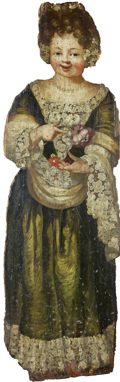
FIG. 16 A Dummy Board Figure of a Little Girl carrying a Bunch of Flowers. Anglo-Dutch school, seventeenth century. Oil on wood, 93.3 by 27.9 cm.

linking it to the sixteenth- and seventeenth-century English