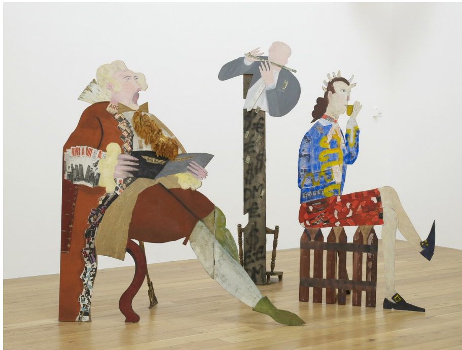
FIG. 10 Detail of Fig.1, showing 'The Art World'. (Hollybush Gardens, London).

To the right of the art critic is a male arts funder, who sits on a rudimentary fence, 'unable to decide between the critic's song and the fad of the day. Should he support the disabled, the Black, the women, or wait until someone else gives permission – the countless perhaps?'. 29 His presence documents the instability of support (despite the GLC's efforts) for artists considered 'other' in 1980s London. 30 Next along are two embracing men with red lips, labelled as 'The Angst/Complacent School of British Painting'. Himid has suggested that she was 'thinking about Gilbert and George and [. . .] Stephen and Adrian Wisziewski'. 31 The latter artists, part of the so-called New Glasgow Boys, were viewed, according to Himid, as 'the saviours of painting'. Rejecting the minimalism and abstraction that were prevalent during this period, they produced works that incorporated narrative, social realism, history painting and the human figure. Yet they operated in a privileged realm of British art, populated by elite, and often dandified, white males, and benefited from an environment in which their work was 'firmly placed in a private commercial dealer system'. 32 These figures might be seen as part of a larger critique of gay white male privilege in the art world, another aspect, perhaps, to Himid's engagement with Hockney.