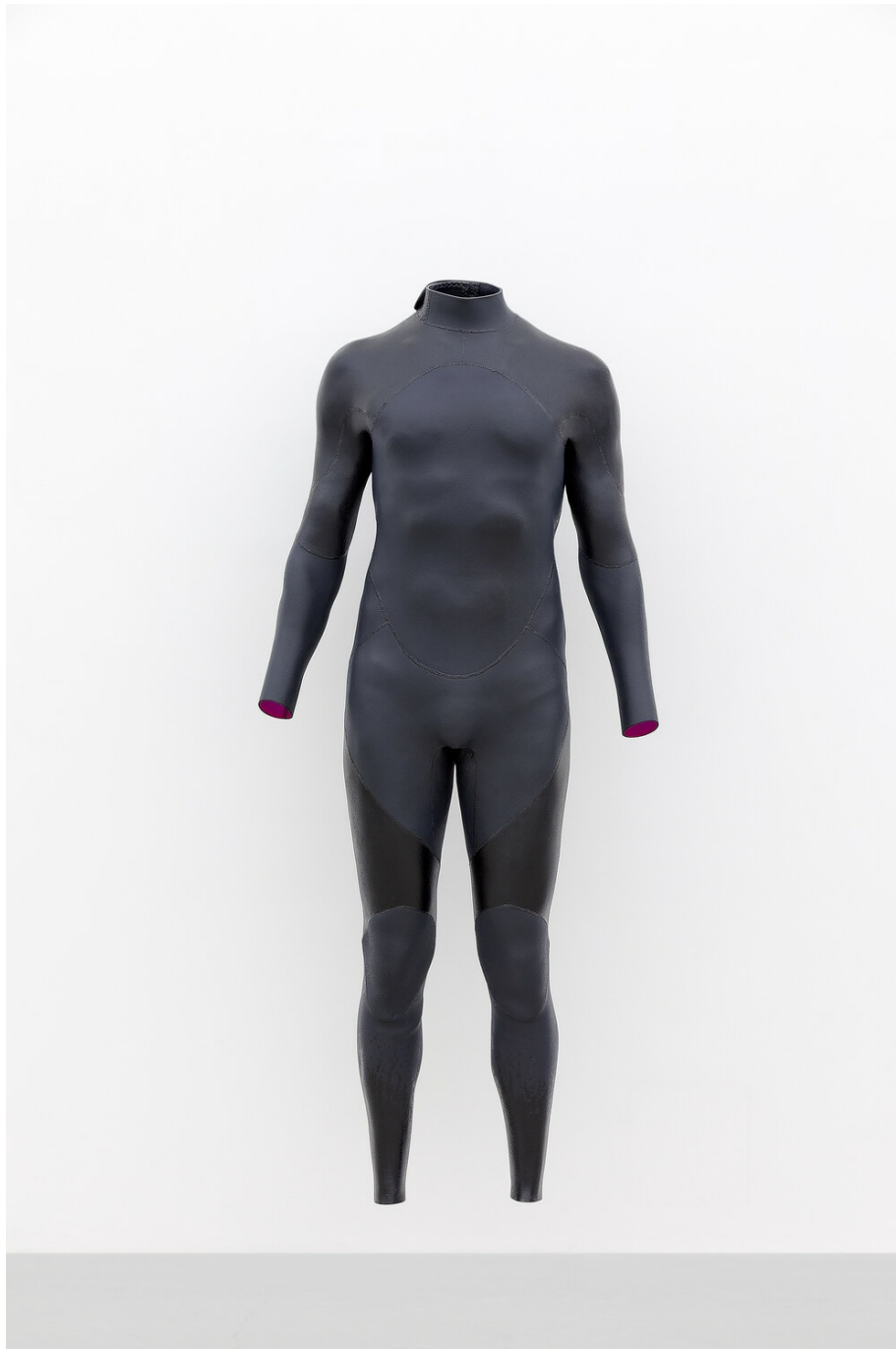
Fig. 4 Self-Portrait (Wetsuit) , by Alex Israel. 2016. Acrylic on aluminium, 140 by 61 by 45.7 cm. (Private collection; © Alex Israel; photograph Zarko Vijatovic).