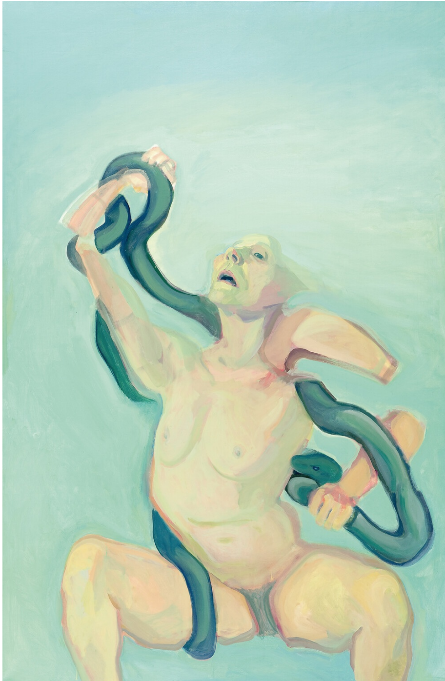
Fig. 1 Woman Laocoön , by Maria Lassnig. 1976. Canvas, 193 by 127 cm. (Neue Galerie Graz, and Universalmuseum Joanneum, Graz; © Maria Lassnig Foundation; Photograph N. Lackner / UMJ).

It is a strength of the volume that although little knowledge is assumed about either art or myth, the writing is sophisticated, as are many of the ideas presented in James Cahill's introductory essay. To wit, the author insists on the discursive, dialogical nature of myth – the fact that myths are stories that anticipate and echo each other, in other words, that they are in conversation. It is a further credit to this book that it includes examples of contemporary art that break with the idea of illustration, engaging myth in ways that are overtly theoretical and self-reflexive, such as