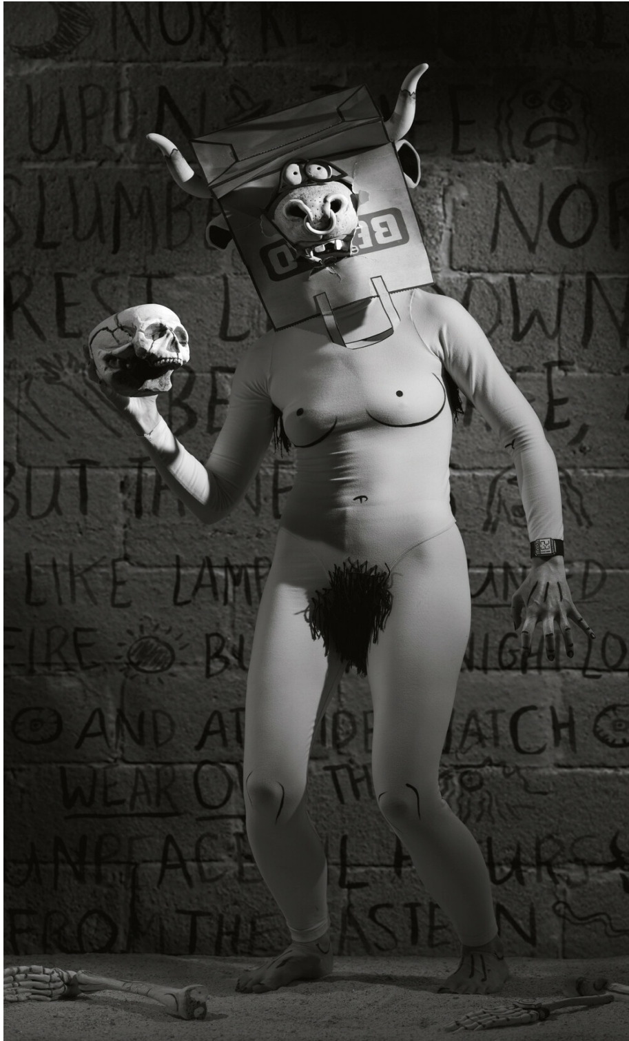
Fig. 3 Minotaur with Skull , by Mary Reid Kelley with Patrick Kelley. 2015. Lightbox photograph, dimensions variable. (Courtesy of the artists and Pilar Corrias Gallery, London).