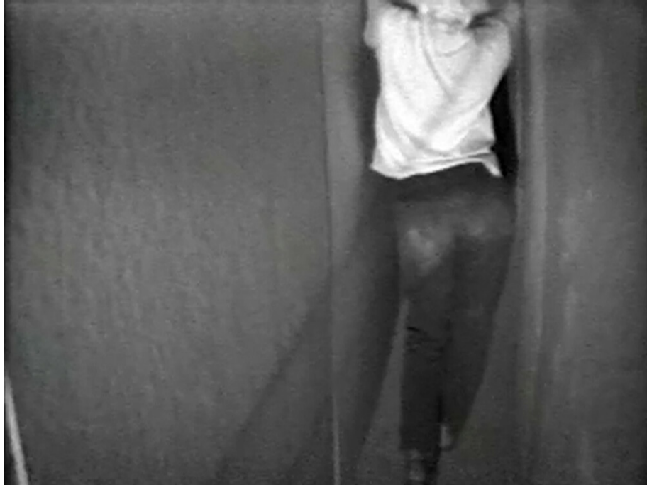
Fig. 2 Still from Walk with Contrapposto , by Bruce Nauman. 1968. Video, 60 mins. (Courtesy of Electronic Arts Intermix (EAI), New York).

Felix Gonzalez-Torres's minimalist installation of two, door-shaped mirrors Untitled (Orpheus, Twice) (1991). For if myth is a well-mined storehouse of sensational, readymade narratives, it is also, as Cahill reminds us, a way of seeing that lends form and significance to abstract ideas about vision, mortality and love.