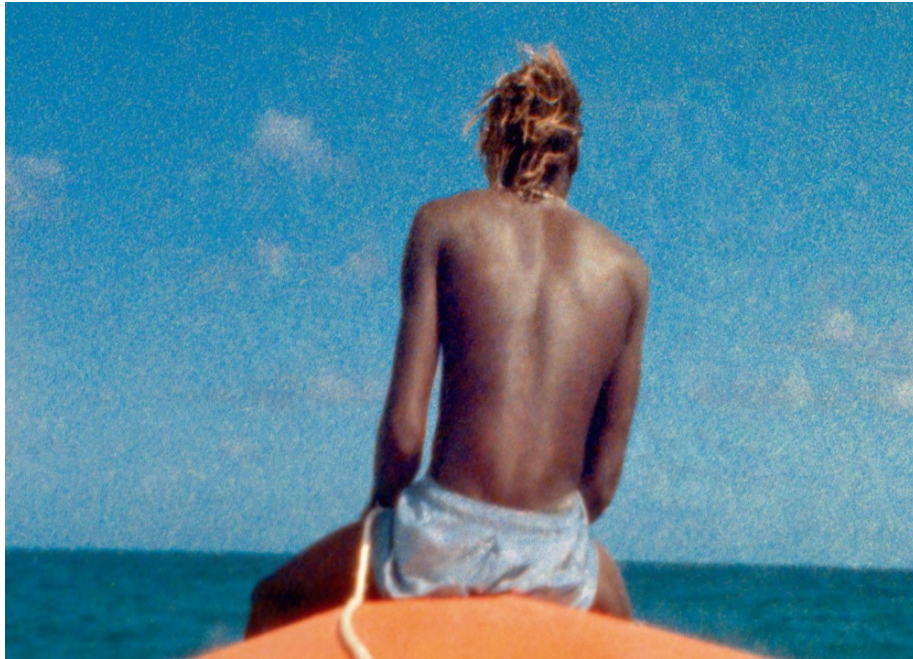
Fig. 5 Still from Ashes , by Steve McQueen. 2002–15. Super 8mm and 16mm. (Courtesy the artist, Thomas Dane Gallery and Marian Goodman Gallery; exh. Tate Modern, London).