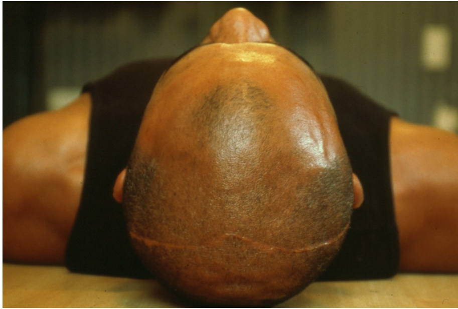
Fig. 2 7th Nov , by Steve McQueen. 2001. Single 35mm slide. (Courtesy the artist, Thomas Dane Gallery and Marian Goodman Gallery; exh. Tate Modern, London).

While McQueen prioritises the formal qualities of film for his audience – listening and looking – his films are also rich in content and allusion. Static , for example, exploits the symbolic power of the Statue of Liberty, with its historic associations from the American dream to the September 11th attacks in 2001. McQueen does not shy away from the political. End Credits (2012–ongoing) FIG. 4 , for example, takes the form of scrolling FBI reports on Paul Robeson, an African-American singer, actor and Civil Rights activist investigated in the 1950s for his associations with the Communist party. These reports are read by an expressionless female voice but out of sync with the visuals, which produces a disjointed viewing experience. The word ‘redacted’ is used to verbalise the redacted words and passages in the reports, its repetition such that the word loses meaning, becoming a rhythmic, almost abstract, element.