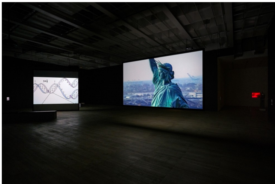
Fig. 1 Installation view of Steve McQueen at Tate Modern, 2020, showing the films Once Upon a Time (2002) and Static (2009).

Two films are projected in the central atrium. The first, Static (2009), is a seven-minute aerial shot of the Statue of Liberty in New York FIG. 1 . The camera circles her and the noise of the helicopter borders on offensively loud. The sound of the blades becomes like static from a radio; the feedback plus the shaky camera makes for a dizzying uncomfortable experience. The second, Once Upon a Time (2002), is a looped projection of images selected by NASA to represent life on Earth to extra-terrestrial life-forms, set against a soundtrack of Glossolalia.