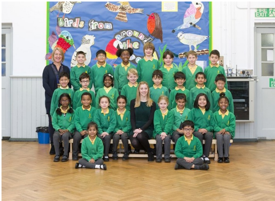
Fig. 6 Year 3 Project: Poplar School , by Steve McQueen. 2019. (Courtesy the artist and ArtAngel; exh. Tate Britain, London).